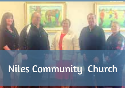
Niles Community Church