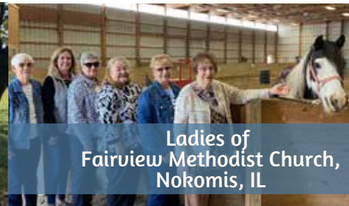
Ladies of Fairview Methodist Church, Nokomis, IL